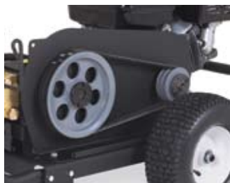
Double belt drive for durability and power.