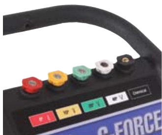
Convenient built-in color-coded tip holder to keep tips within reach for easy access.