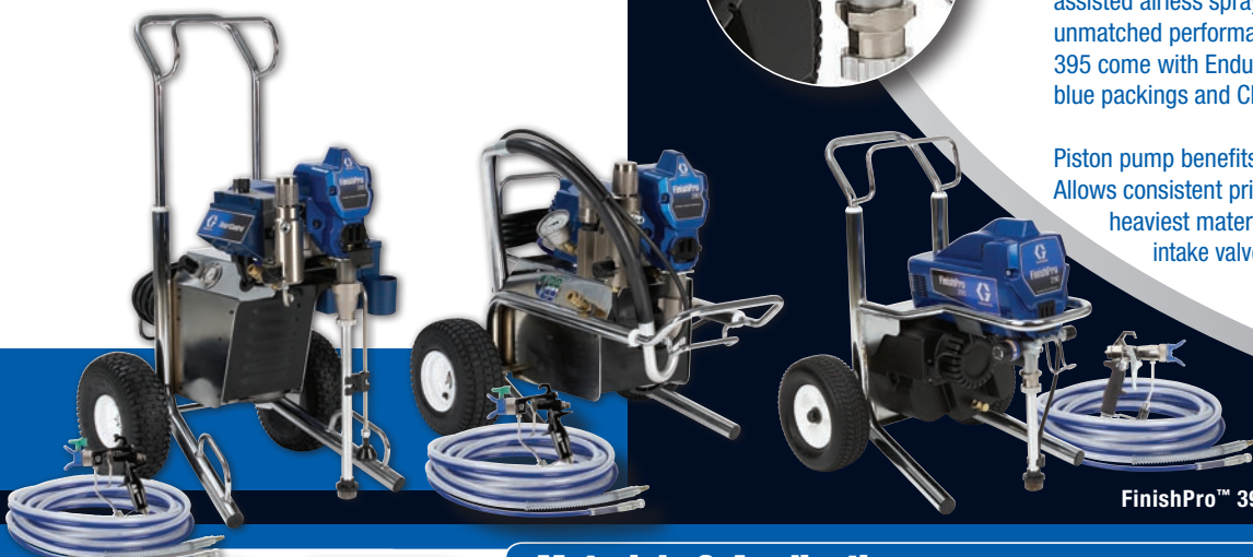
FinishPro™ 395 - FinishPro™ 390 - FinishPro™ 290

Allows consistent priming and pumping of even the heaviest materials – without thinning. QuikAccess™ intake valve makes cleaning or clearing debris easy.